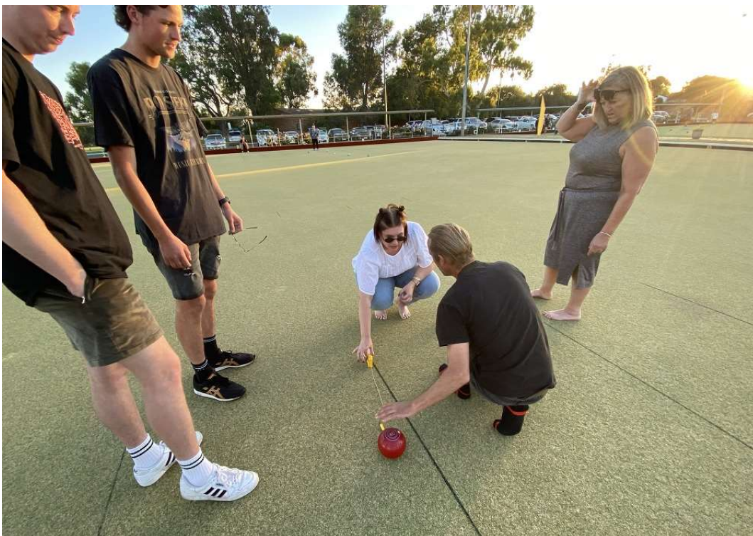
The tape measure got a good workout on Rink 3

After going from chocolates in Week 2 to boiled lollies in Weeks 3 & 4, The Lenny's ended the season by winning their last 2 games, defeating Out On Parole in an out and out slugfest on Grass Rink 3, with the game featuring 8 ends (Out of 10) with a hold of just 1 shot, as the Lenny's prevailed 4-2, 3-3.