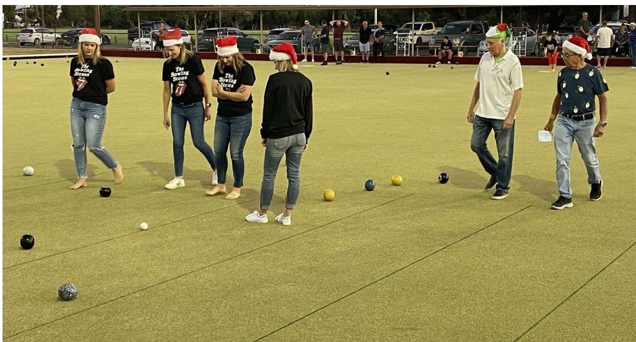
The Christmas Contest between the Bowling Stones and Top Shots on Grass Rink 1

Before I get into the other results, I should note that it was that it was nice to see a few teams go the extra mile and rock up with some type of Christmas gear (The Bowling Stones, Team Pamba, Top Shots, CD's, Beginner's Luck to name a few), even though Half Price mentioned nothing about it, and with a spare bottle of wine for the awards ceremony due to the absence of Howards End, we decided to hand out an impromptu award for the Best Christmas Uniform on the night, which you can read about below.