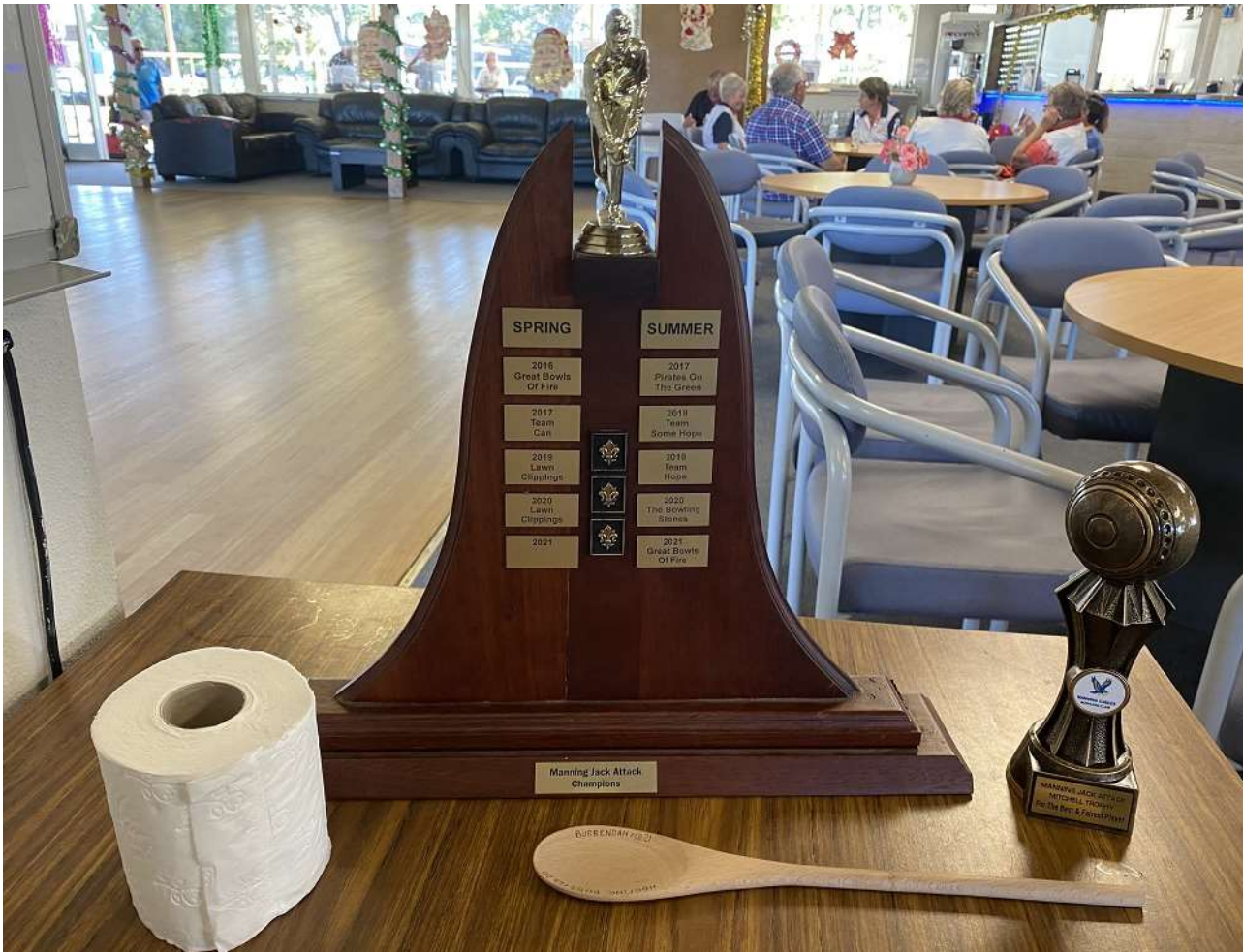
The Awesome Foursome of Manning Jack Attack Trophies; The Champions Trophy, The Mitchell Trophy (Best & Fairest player), The Wooden Spoon, and the Toilet Roll for finishing 2nd last, because you'd be Close to Crap.