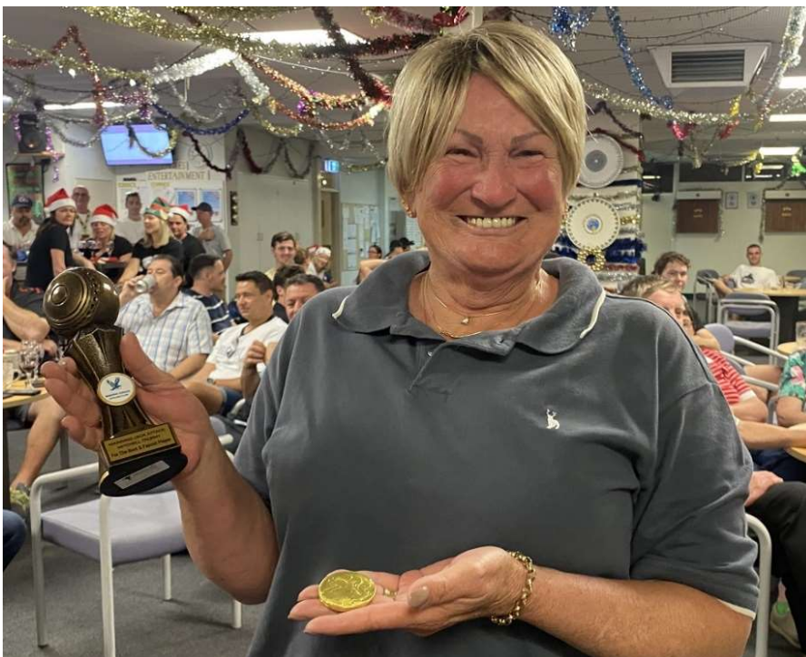
A smile so bright it could've melted that frozen chocolate medal that I kept in the freezer for too long.