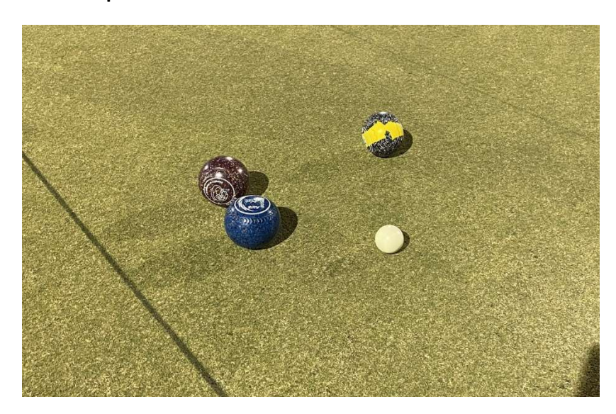
The word from the Great Bowls is Craig's got your spot next week, Todd.

Going through the other tiebreak results: