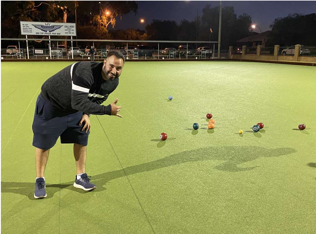
Derek Zoolander posing for the camera... And there's his beloved MV Wholesale sign as well