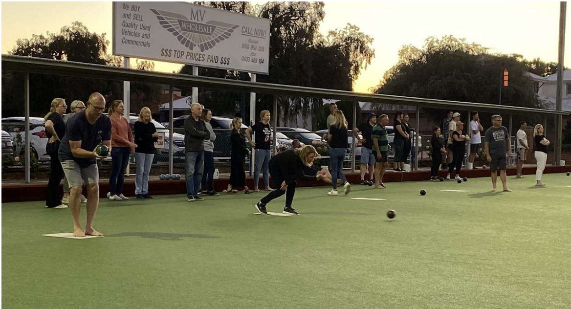
The Synthetic Rinks early into the night's play

With summer now only a week away, Week 3 and the official halfway mark of the Manning Jack Attack season was upon us, and thankfully we got an absolute treat with the weather after a 28 degree day, and with this being the third to last game prior to the finals, trying to pick the Top 4 come the end of Week 5 is harder to pick than the proverbial broken nose, because there's still 18 teams who could still finish in the Top 2, so you'll be hard-pressed to see any tanking for draft picks and easier opponents, although you could see quite a few fixture requests in Weeks 4 and 5.