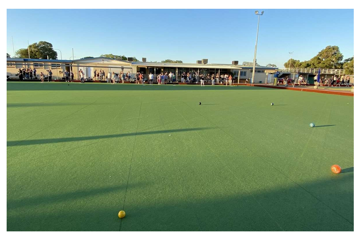
The season begins

Ahead of a near perfect night for bowling, there was only one fixture change due to Team Swan and Zebras being unavailable, with Beginner's Luck and Ten Pin being shifted onto Synthetic 3, which meant only 5 Grass rinks were in use, much to the relief of Dave the Greenkeeper.